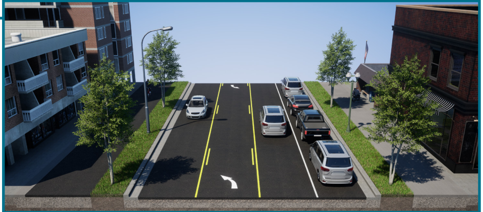
North of University: Shared Use Path