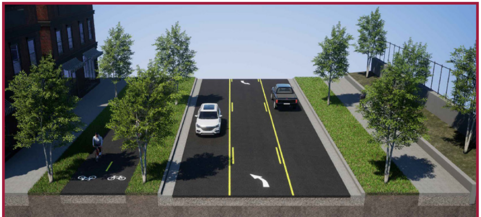
South of University: Two-Way Cycle Track